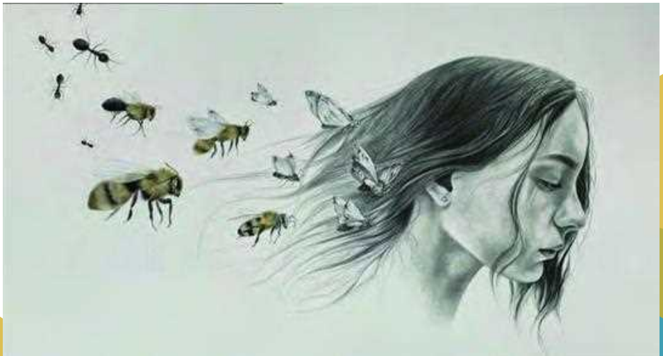
Invasion Tahlia Holden 2022

Installation of single channel video with graphite and pencil drawing on paper.